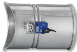
CONNECTION TO CIRCULAR DUCTS