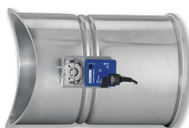
CONNECTION TO CIRCULAR DUCTS