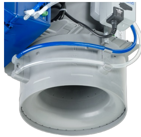
VARIANT WITH NOZZLE AND CONNECTING CIRCULAR SPIGOT

Variant with nozzle and connecting circular spigot