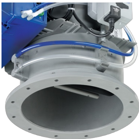
VARIANT WITH BLUFF BODY AND FLANGE

Variant with nozzle and connecting circular spigot