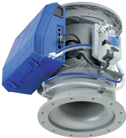
VAV TERMINAL UNIT TVLK WITH NOZZLE AND FLANGE