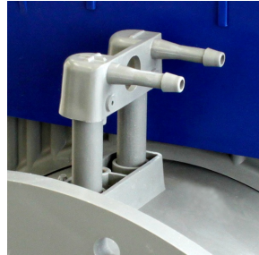
EASY CLEANING OF SENSOR TUBES