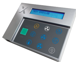
CONTROL PANEL TYPE BE-LCD