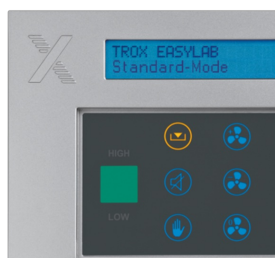
DISPLAY, FUNCTION BUTTONS WITH STATUS DISPLAY