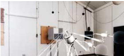
MEASUREMENTS ON SOUND ATTENUATORS ACOUSTICS