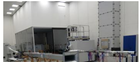
TEST FACILITIES CONTROL TECHNOLOGY